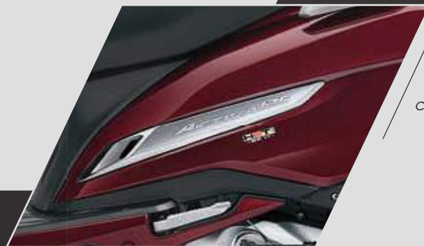
PREMIUM CHROME ON BODY

Spacious front glove box adds additional storage space.