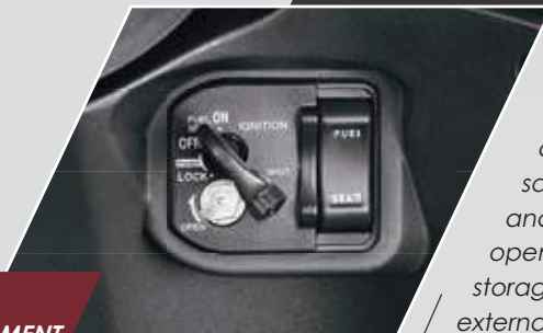
MULTI FUNCTION SWITCH UNIT

One compact console ensures safety of the vehicle and convenience of opening underseat storage & external fuel lid.