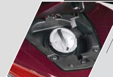
DOUBLE LID EXTERNAL FUEL FILL

One compact console ensures safety of the vehicle and convenience of opening underseat storage & external fuel lid.